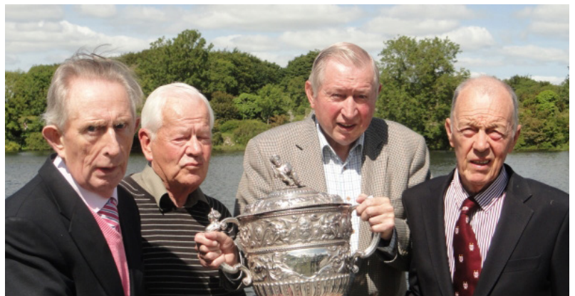
Old Boys at Galway Regatta 2015

Please pass on the Newsletter to any other Jes Rowers or interested parties of your acquaintance.