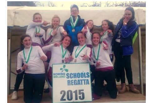
Under 16 girls eight at Schools Championships