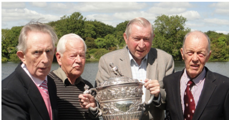
Old Boys at Galway Regatta 2015

Please pass on the Newsletter to any other Jes Rowers or interested parties of your acquaintance.