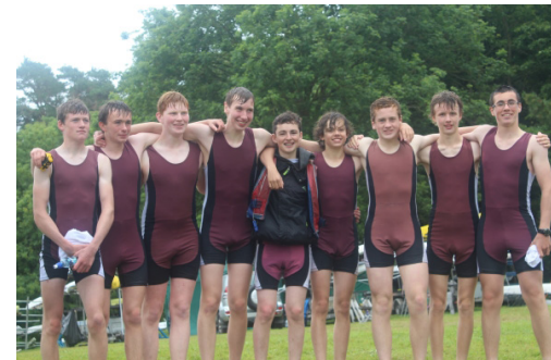
Under 16 Boys at Champs