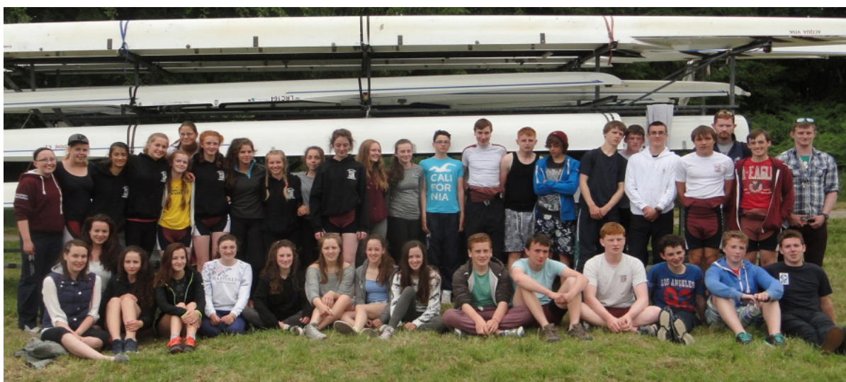
Club Rowers and coaches at National Championships Iniscarra Co Cork July 2015

The Rowing Club title is Coláiste Iognáid Rowing Club and our website is circ.ie . The website contains up to date information and a very extensive archive including photographs of crews and rowers dating back to the beginning of the club in 1934.