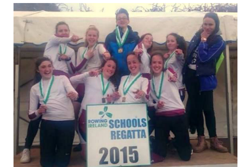
Under 16 girls eight at Schools Championships