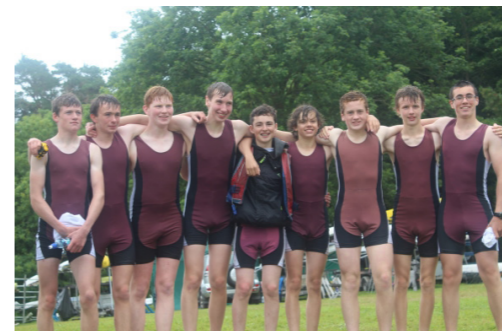
Under 16 Boys at Champs