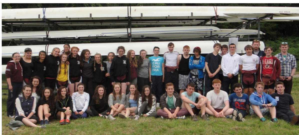
Club Rowers and coaches at National Championships Iniscarra Co Cork July 2015

The Rowing Club title is Coláiste Iognáid Rowing Club and our website is circ.ie . The website contains up to date information and a very extensive archive including photographs of crews and rowers dating back to the beginning of the club in 1934.