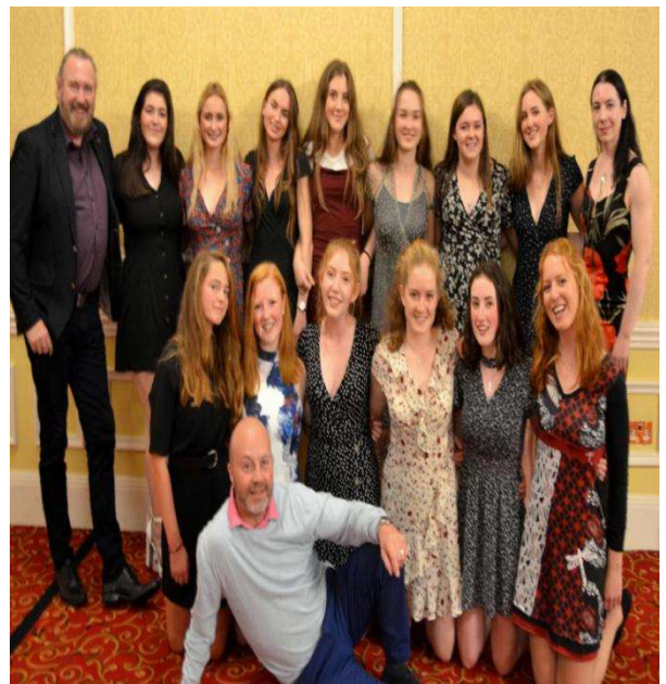
Senior Women's Squad and Coaches