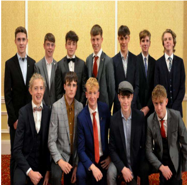
2019 Senior Men's Squad