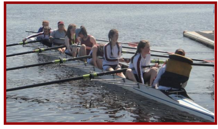
Girls Under 15 Eight

The club had intended to travel to Metro in Blessington but this regatta was cancelled early due to water levels being far too low to allow racing. This cancellation highlighted the future value of the Lough Rynne course.