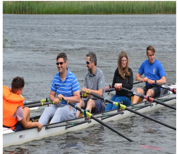
Teachers and Parents in tour Boat

Following the very positive response by parents to our appeal for funding to purchase equipment (oars being our most critical requirement at the time) the club has purchased a set of Sweep Blades (10) and 12 sets of Sculling Blades and these have arrived in time for the new season. The very significant number of new beginners and the large cohort of last years' first years particularly boys resuming training means that the total number rowing will now reach ninety and this in turn puts pressure on equipment and coaching resources.